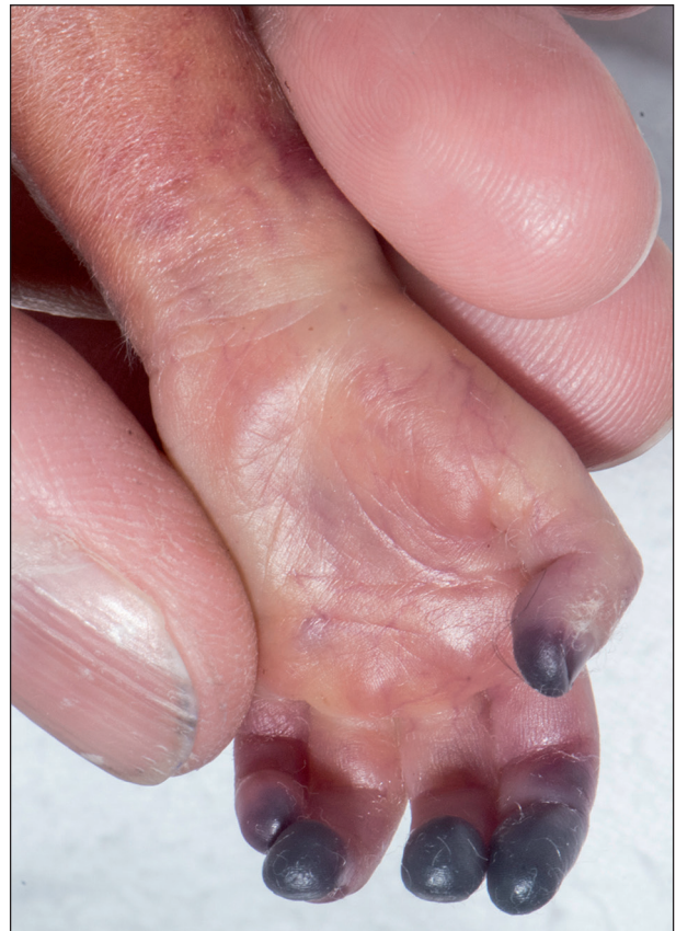
Figure 3. Palmar left hand.

The colour of the digits of the left hand improved steadily after the PICC line was removed and GTN was started ( Fig. 3 and Fig. 4 ). The neonate was transferred to another hospital and returned to the base hospital after 6 weeks. When reviewed, only the tip of the index finger remained black ( Fig. 5 ).