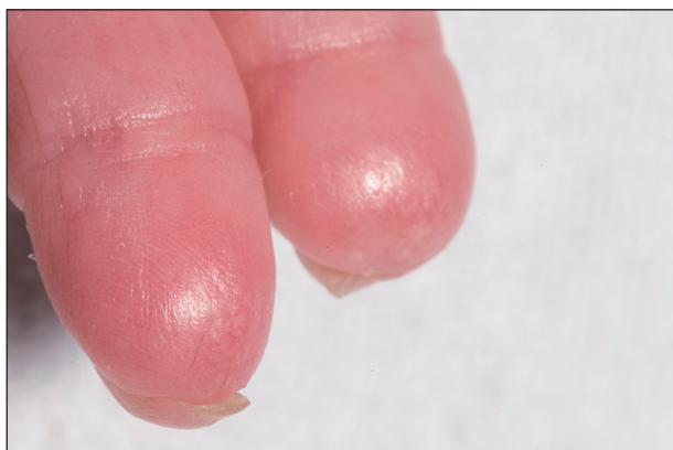
Figure 6. Follow-up left hand: lost fingertip.