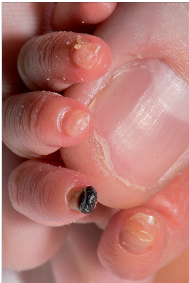
Figure 5. Follow-up left hand: black fingertip.

A repeat Doppler of the upper limb was performed 10 weeks after the PICC insertion. The brachial, radial and ulnar arteries were clear with good triphasic flow throughout. This was consistent with the clinical improvement in the colour of the digits. Eventually, the distal 2 mm of the index fingertip was lost ( Fig. 6 ). The long-term effect of this has yet to be seen. However, the outcome appears to be good given the nature of the injury and range of possible outcomes and amount of tissue lost.