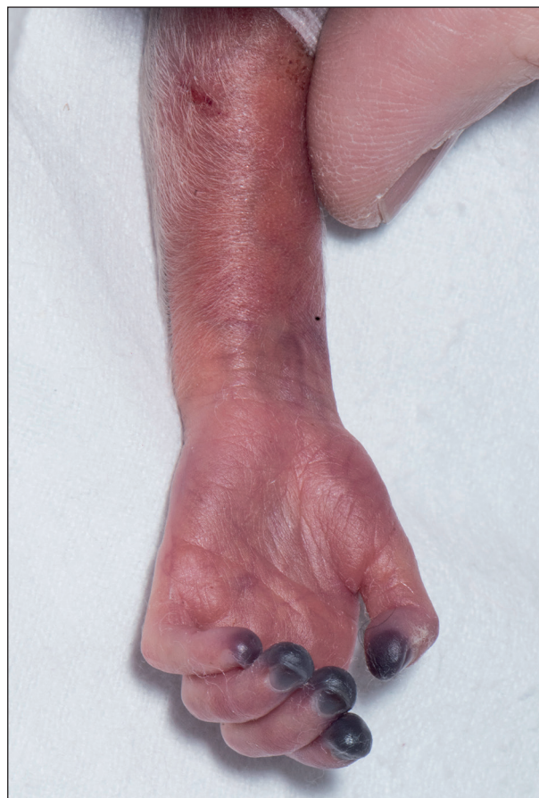
Figure 2. Ventral left forearm and hand.

The neonate's mother was initially updated by a nurse over the phone regarding the PICC line removal. The consultant had a discussion with her the following day when she visited, and duty of candour was performed.