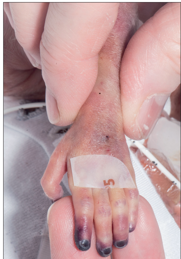
Figure 4. Dorsal left hand.