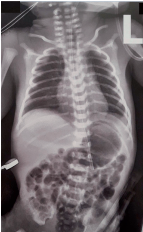
Figure 2. A neonatal chest x-ray with poor beam restriction. There is no evidence of any protective tool.

Increasing the FFD is an effective method to reduce patient radiation exposure during a radiological examination [11, 22]. Several studies have recommended the use of an updated FFD of 130 cm instead of the conventional FFD of 100 cm