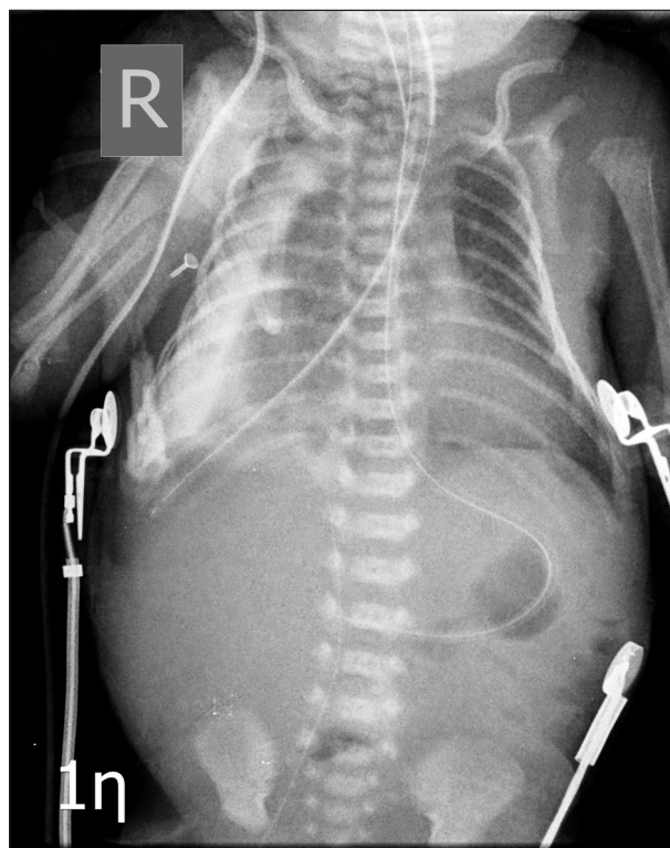
Figure 2. Chest radiograph showing the orogastric tube in its place, while a nasogastric one was inserted additionally and positioned appropriately.

In conclusion, esophageal perforation is not uncommon in premature infants during nasogastric