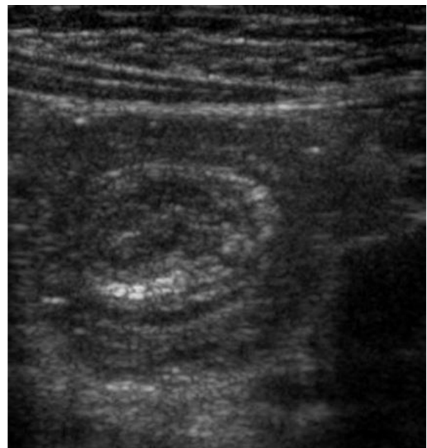
Figure 1. Urgent US re-evaluation finally evidenced typical intussusception sign (target US sign) in mesogastrium.

Patients with isolated polyps in PJS previously described were observed mostly in the 4 th decade of life, whereas PJS patients present more often in