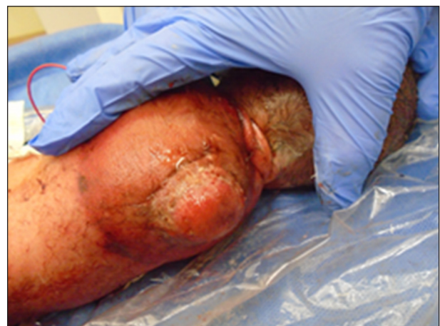
Figure 3. Initial presentation at birth.

The Authors declare that there is no conflict of interest.