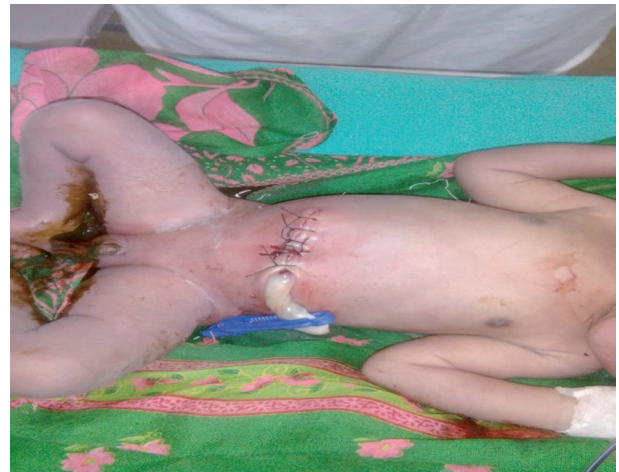
Figure 5. After reduction.