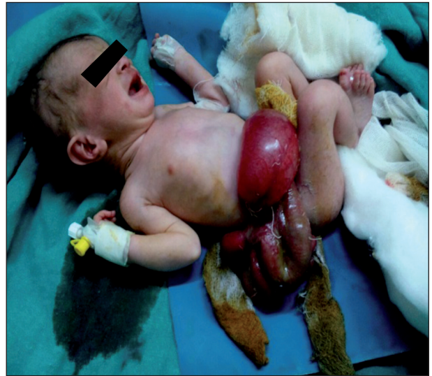
Figure 3. Complicated gastroschisis showing edematous gut.