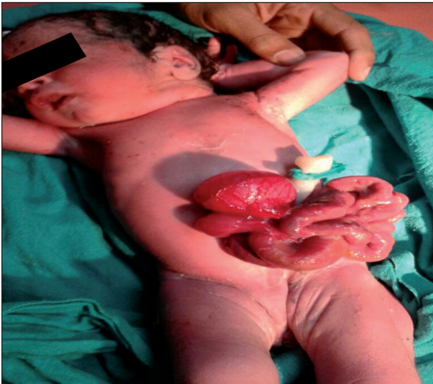
Figure 2. Simple gastroschisis with healthy gut.

In 2 cases the gut was ischemic and friable, so during reduction the perforation of gut occurred. The gut was reduced and the perforated end was brought as ileostomy. In one case, there was no distal atresia and the ileostomy closed spontaneously. In the other case, the child died due to sepsis.