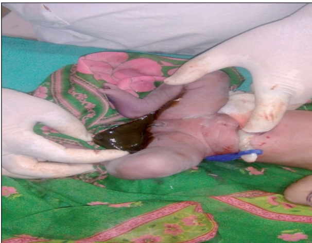
Figure 4. Passage of meconium during the procedure.