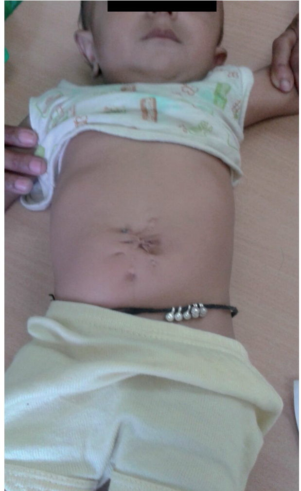
Figure 7. Patient at 6 months of age.

The management of neonates with gastroschisis depends on factors such as the amount of herniated bowel, size of abdominal cavity, age of presentation, associated anomalies. Prenatal diagnosis helps