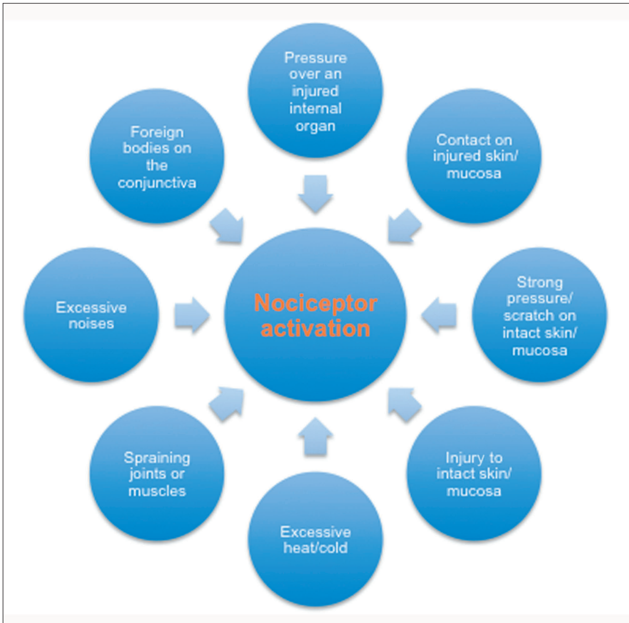
Figure 2. Manoeuvres that activate nociceptors.

studied mainly on heel pricks. It consists of the so called “3 T” intervention: taste (instillation of a few drops of 10% glucose solution or breast milk in the baby’s mouth), touch (gentle massage on the back or the head with slow, circular movements) and talk (the mother or nurse will talk continuously to the infant with a gentle tone of voice, or may use a music box to keep the auditory stimulation) [39]. SS has been adopted by several national guidelines for neonatal analgesia including guidelines by the Pain Study Group of the Italian Society of Neonatology or the Association of Pediatric Anesthetists of Great Britain and Ireland [40-43].