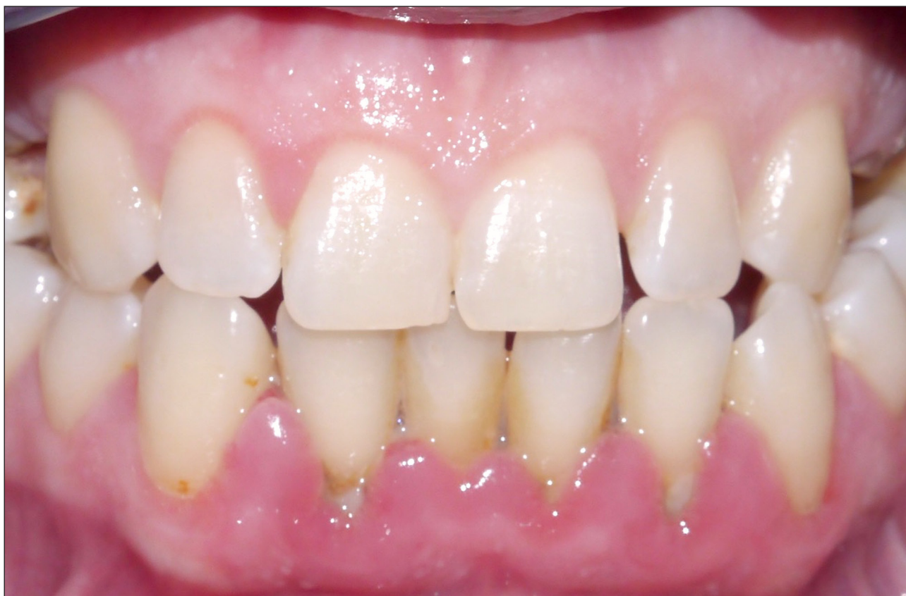
Figure 2. Gingivitis and periodontitis in a pregnant patient.

The host response to the bacterial infection of the teeth and subgingival environment also plays an important role in the tissue-detrimental pathogenic mechanisms of periodontal diseases, involving inflammatory cells and host inflammatory mediators like PGE_2 , matrix metalloproteinases and the cytokines interleukin IL- 1, IL-6 and TNF- \alpha . The last two decades of research have significantly changed the understanding of the pathogenic processes that