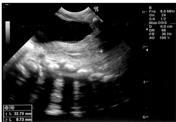
Figure 2. Pelvic ultrasound.