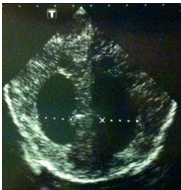
Figure 1. Intraventricular, parenchyma and subarachnoid haemorrhage in the transfontanelar ultrasound of case 4.

A healthy twenty-seven-year-old woman, A Rh negative, G5P4, with inadequate prenatal coverage (negative VDRL in the first trimester). Premature delivery by cesarean at 35 weeks of gestation, due to fetal distress. Birth weight 2,350 g. Apgar score 3/5/7, needing advanced life support measures. Presented at birth with hydrops fetalis (negative Coombs test) and a petechial rash that evolved to septic shock with multiple organ failure with active early gastric, urinary and central nervous system (CNS) bleeding. Laboratory tests revealed positive maternal and newborn serologies: VDRL 1/128, TPHA 1/1,280 and VDRL 1/64, TPHA 1/640, respectively. After birth, other congenital infections were excluded (CMV, Toxoplasmosis, Rubella, HIV and hepatitis B). Due to the