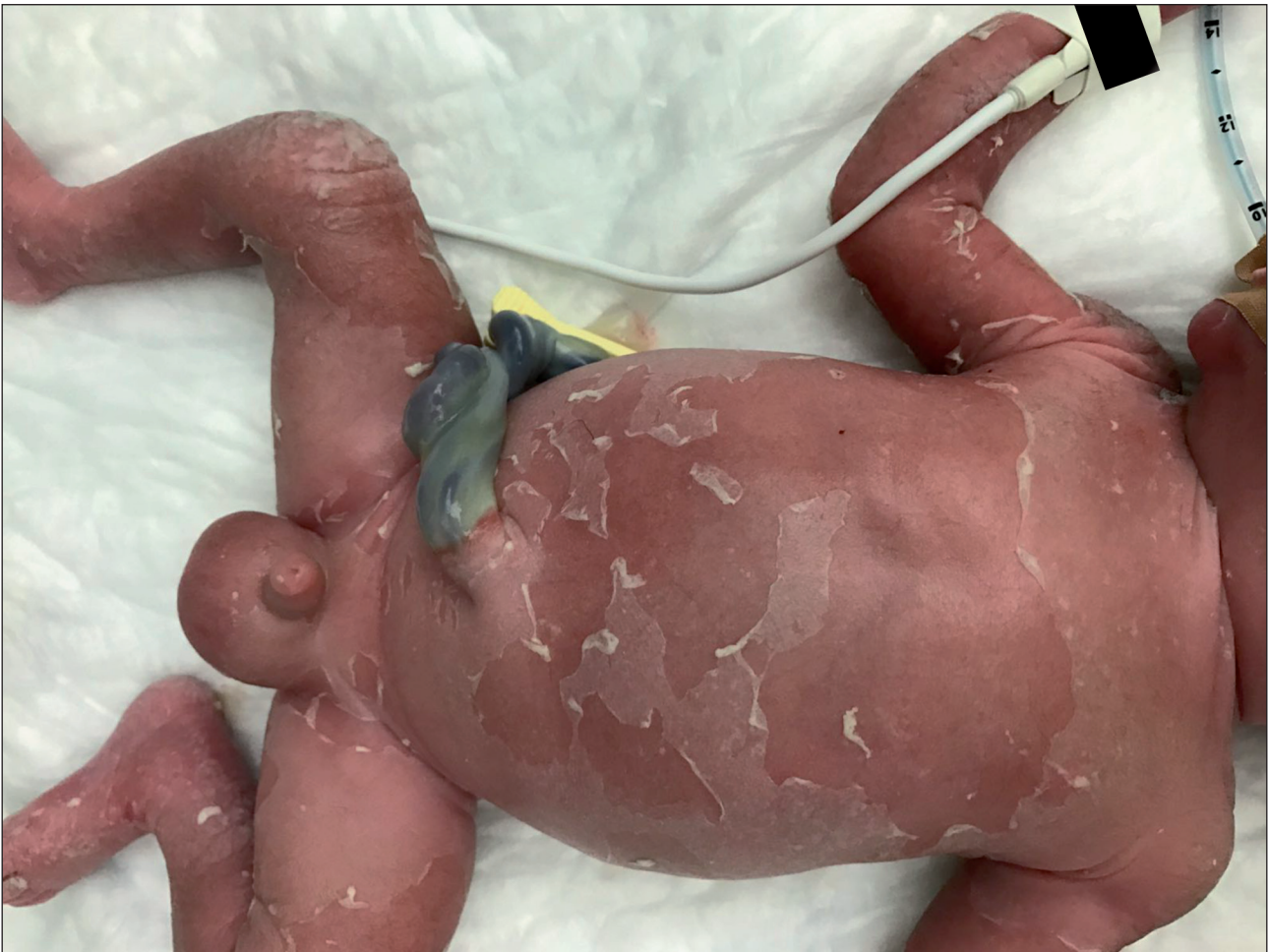
Figure 3. Dry scaly exanthema in the sibling of case 4.

services were also contacted and mother and father were appropriately treated.